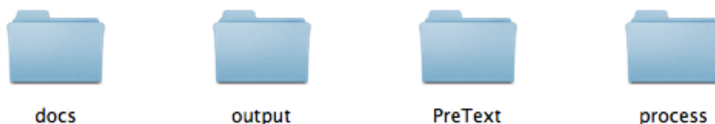
Figure 1: Directory Structure

next section. Inside the PreText folder should be the seven PRETEXT files.